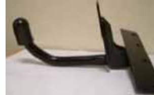
Bolt on 'fixed' Swan Neck