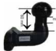
AL-KO Ball correct

These balls should NOT be used with an AL-KO stabiliser. Use of this type of ball could result in the vehicles becoming un-hitched, your stabiliser being damaged and/or a very serious accident happening.