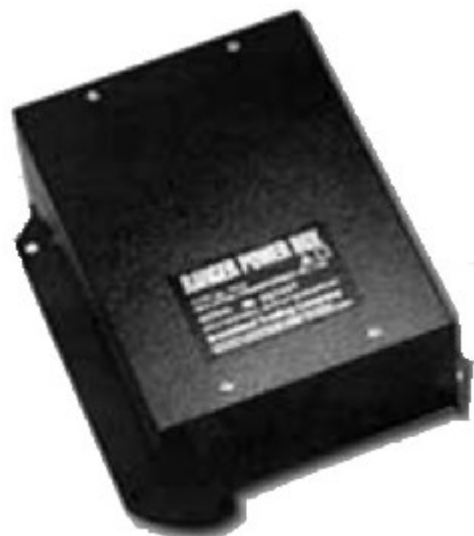
Ranger Power Pack PA10