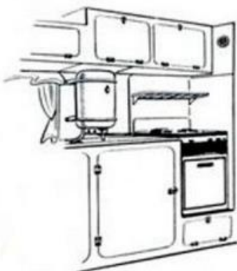
Kitchen installation showing cooker with oven and platerack, gas-operated water heater and capacious lockers.