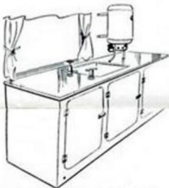
Sink Unit showing cold water tap, water pump and water heater.