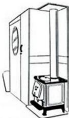
Slow Combustion Solid Fuel Stove is situated immediately inside doorway and adjacent to large wardrobe.

A LTHOUGH the 14 ft. Almond Caravan is ideally suited for use with lighter cars, the Thomson Clyde —an entirely new model—is designed for those whose habits are none the less mobile, but who wish to go along in a bigger way.